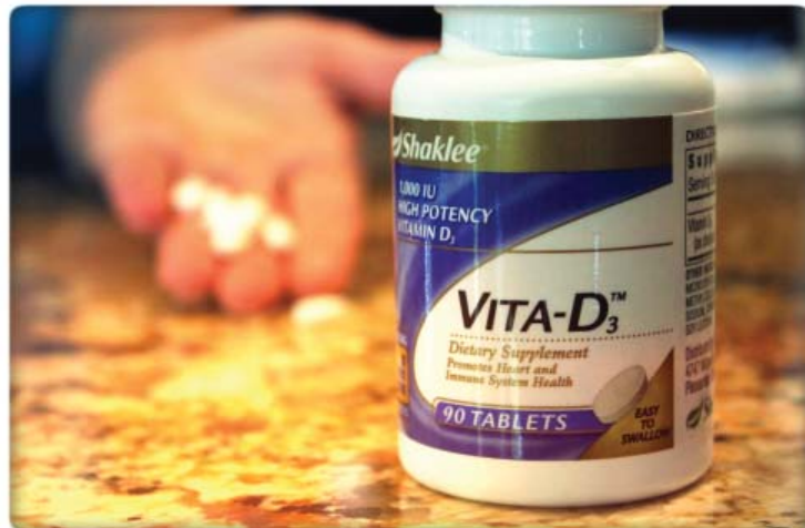
Item #21214 MP: $7.95

...this little anti-stress hormone regulator can boost the immune system and is vital to bone structure, mineral metabolism among many more benefits too numerous to mention here. National Inst. of Health found the higher the blood level of Vitamin D, the lower the frequency of reported upper respiratory tract infections. Those with the lowest vitamin D levels had a 36% increased risk of catching a cold. This little nutrient is linked to: auto-immune, cancer, diabetes, respiratory illnesses, colds, multiple sclerosis, asthma & more. Yet, 80% of Americans are deficient. What is it?